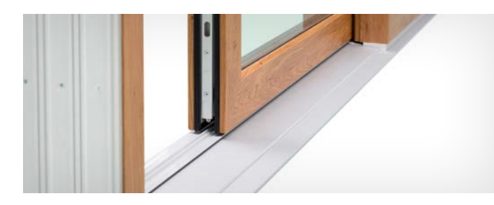
As a standard, three locking hooks that improve safety. The possibility to install modern anti-burglary elements ensuring higher safety level.