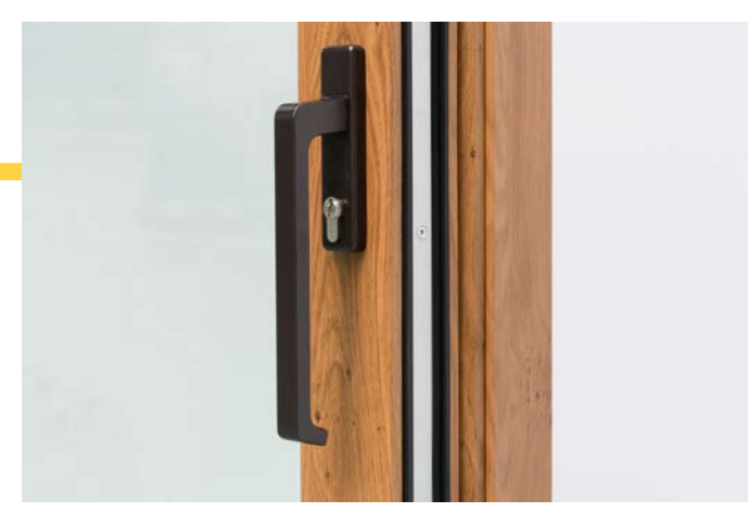
Aluminum handles and knob-handles available in white, brown, silver and light brown colors. Possibility of using internal or double-sided patent insert.