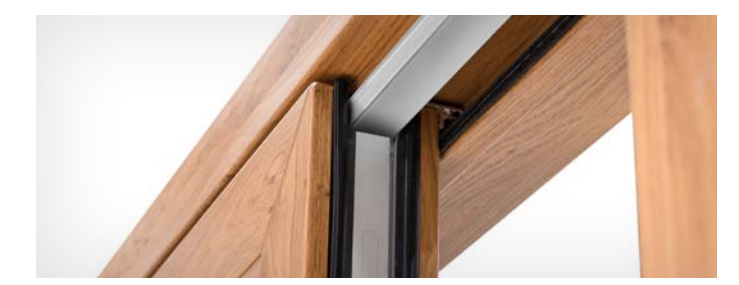
GU fittings guarantee light service.