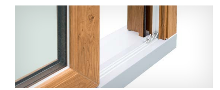
PVC and aluminum threshold. Micro ventilation hook as a standard enables to unseal the door and guarantees optimum air exchange.